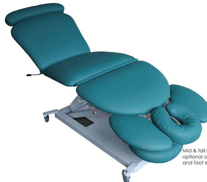
Mid & tail lift shown with optional overhead wings and foot extension