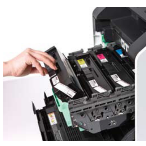
Reduce print costs further with the optional Super High Yield Toner cartridges

Be more productive in the office with the DCP-9055CDN's impressive range of cost and time saving features.