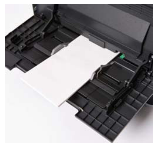
Print on envelopes and thicker media using the multi-purpose tray

Secure Socket Layer (SSL) Encryption. Although documents are sent from computer to printer within seconds, this is long enough for the information to be hacked. SSL prevents this by encrypting the data you send over the network, ensuring confidential reports remain just that.