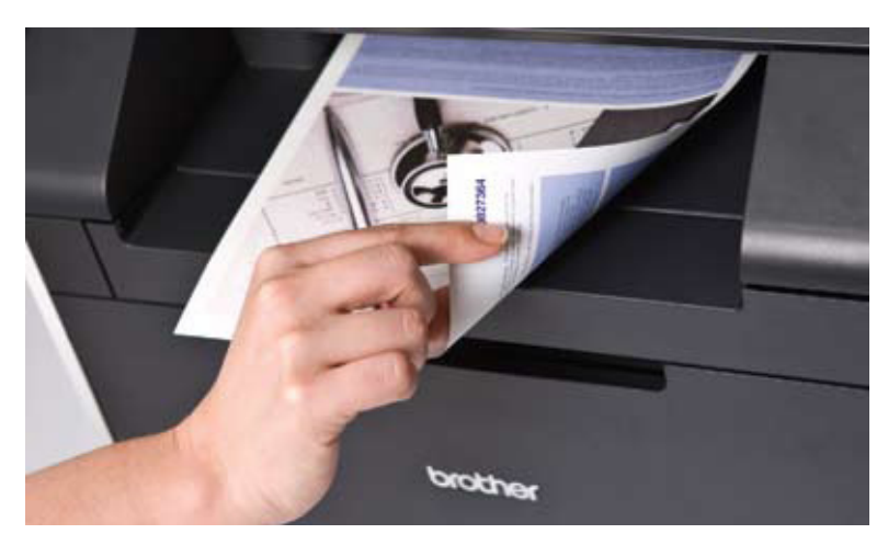
Copy multi-page documents quickly and easily with the automatic document feeder