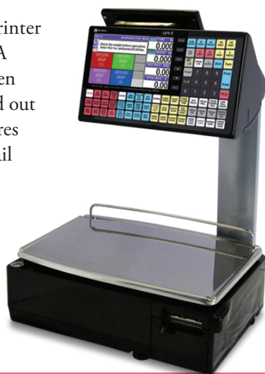
Elevated keyboard and displays type

The Uni-5 is more than just attractively priced. It's also attractive in design, with a polished, black polymer housing that's easy to clean, and a convenient side-loading printer for quick label changing. A low-profile design and green energy consumption round out a long list of essential features for today's progressive retail marketplace.