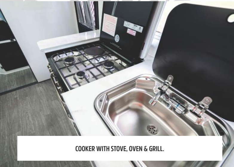
COOKER WITH STOVE, OVEN & GRILL.