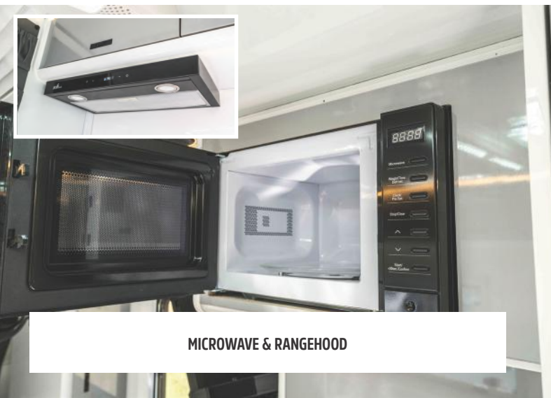
MICROWAVE & RANGEHOOD