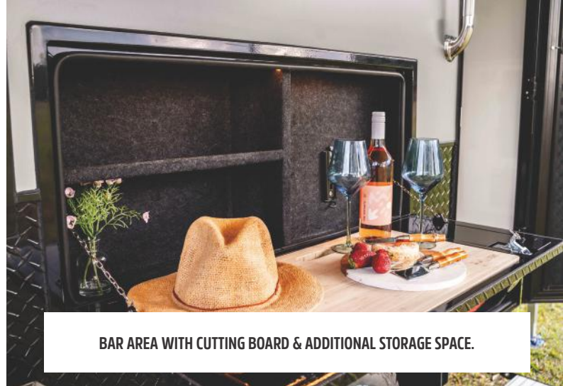
BAR AREA WITH CUTTING BOARD & ADDITIONAL STORAGE SPACE.