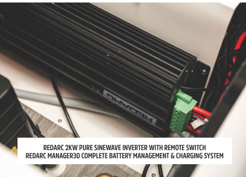
REDARC 2KW PURE SINEWAVE INVERTER WITH REMOTE SWITCH REDARC MANAGER30 COMPLETE BATTERY MANAGEMENT & CHARGING SYSTEM