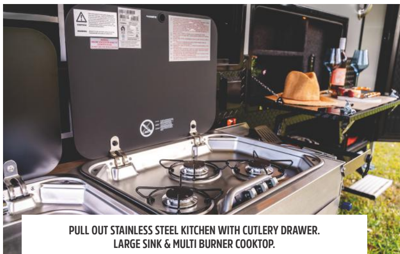
PULL OUT STAINLESS STEEL KITCHEN WITH CUTLERY DRAWER. LARGE SINK & MULTI BURNER COOKTOP.