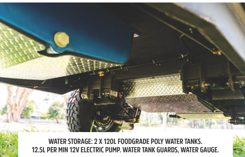
WATER STORAGE: 2 X 120L FOODGRADE POLY WATER TANKS. 12.5L PER MIN 12V ELECTRIC PUMP. WATER TANK GUARDS, WATER GAUGE.