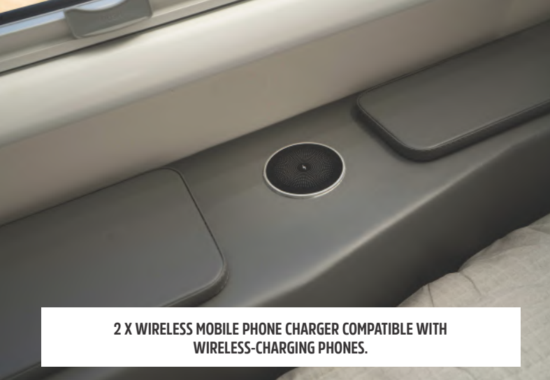
2 X WIRELESS MOBILE PHONE CHARGER COMPATIBLE WITH WIRELESS-CHARGING PHONES.