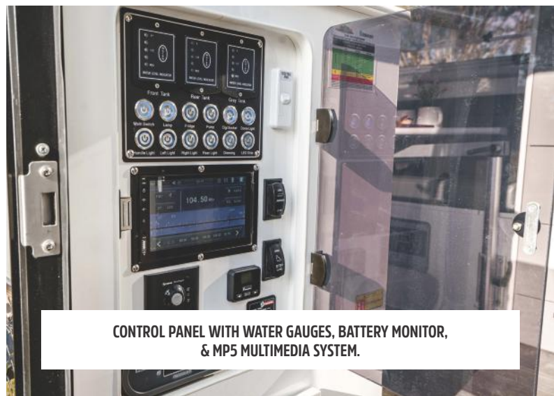
CONTROL PANEL WITH WATER GAUGES, BATTERY MONITOR, & MP5 MULTIMEDIA SYSTEM.