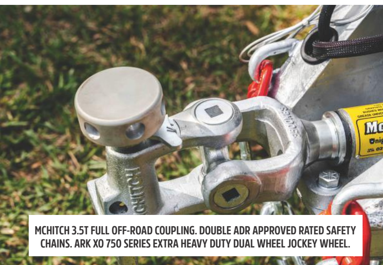
MCHITCH 3.5T FULL OFF-ROAD COUPLING. DOUBLE ADR APPROVED RATED SAFETY CHAINS. ARK XO 750 SERIES EXTRA HEAVY DUTY DUAL WHEEL JOCKEY WHEEL.