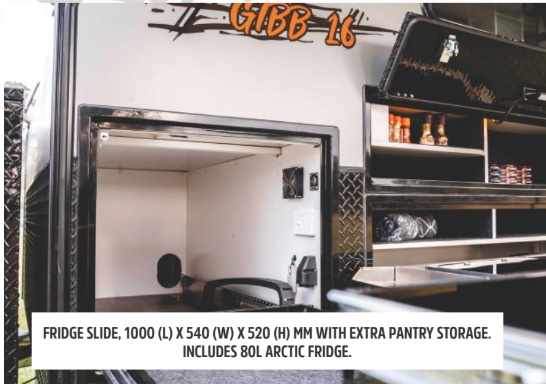
FRIDGE SLIDE, 1000 (L) X 540 (W) X 520 (H) MM WITH EXTRA PANTRY STORAGE. INCLUDES 80L ARCTIC FRIDGE.