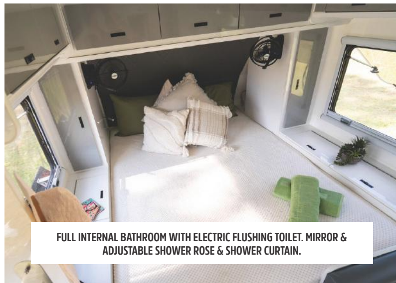
FULL INTERNAL BATHROOM WITH ELECTRIC FLUSHING TOILET. MIRROR & ADJUSTABLE SHOWER ROSE & SHOWER CURTAIN.