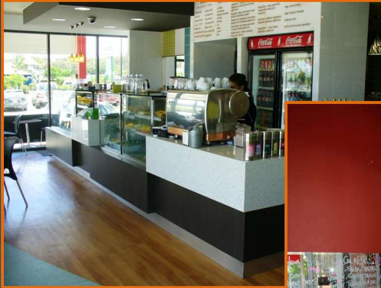
IGA Supermarket Capalaba