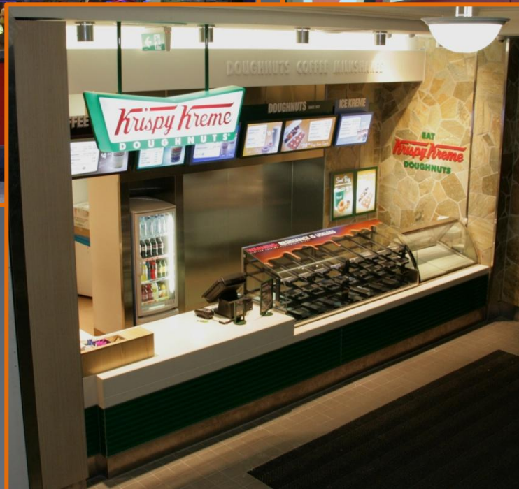
Krispy Kreme Gold Coast