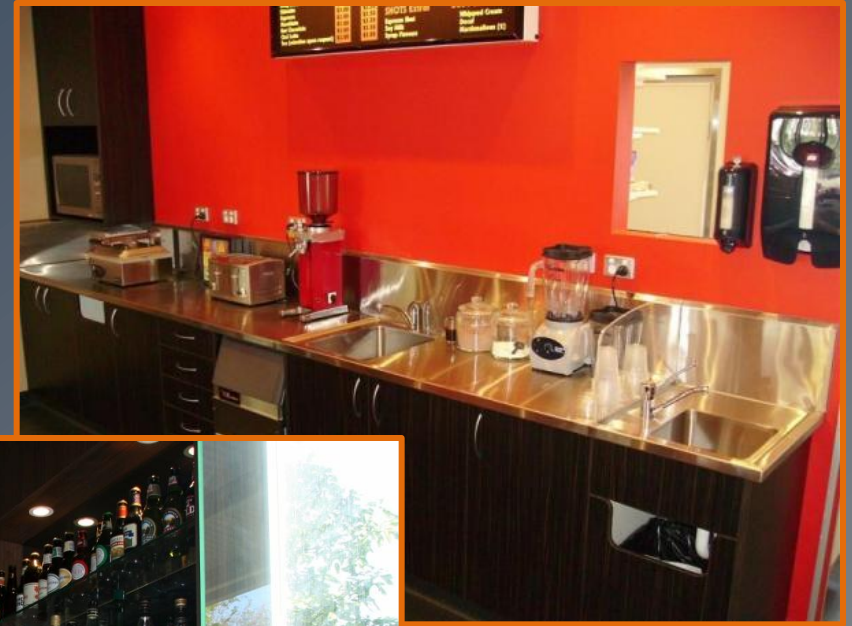
Shots Coffee Burpengary