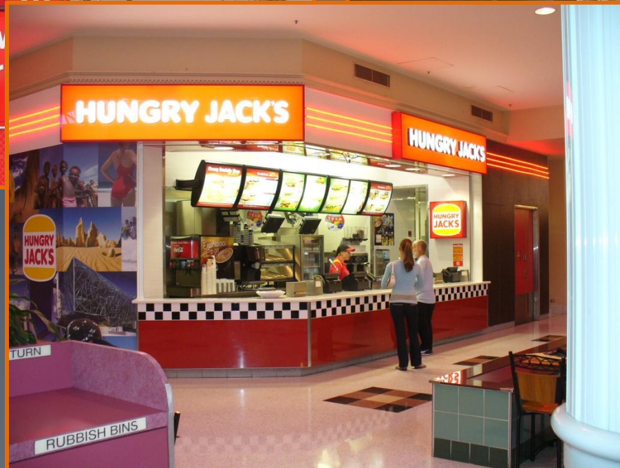
Hungry Jacks Morayfield