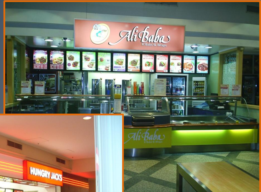
Ali Baba Maroochydore