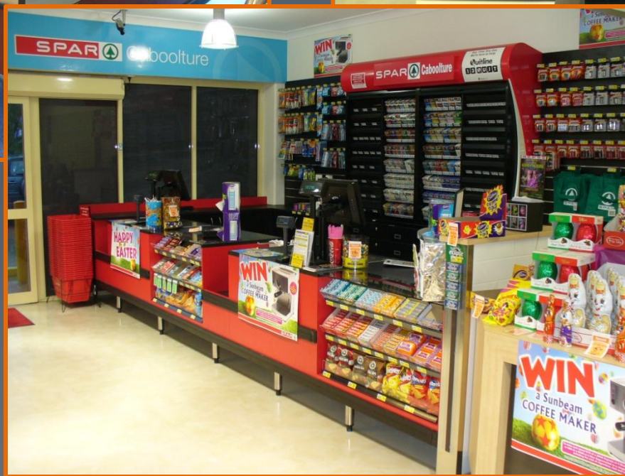
Counters SPAR Caboolture