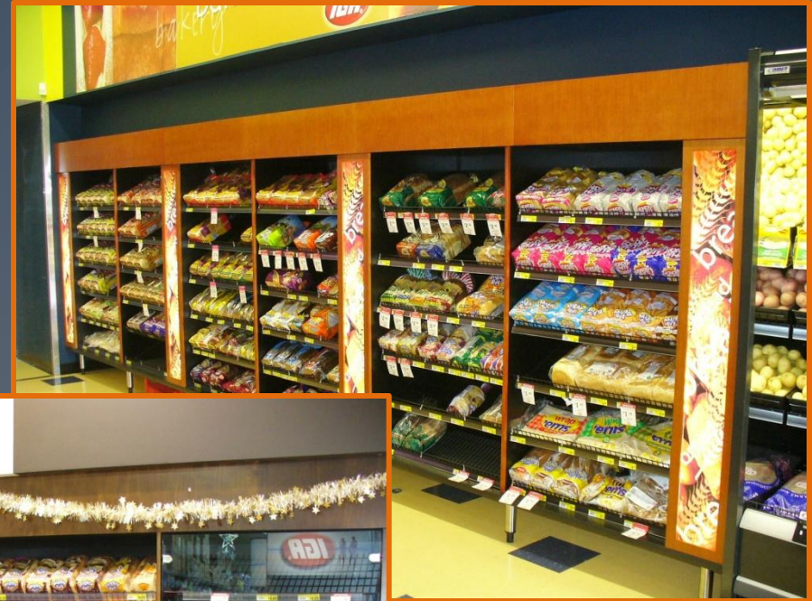
Bread Wall Sandstone Point