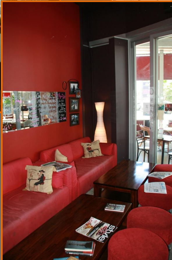
Cou Cou Lounge Brisbane City