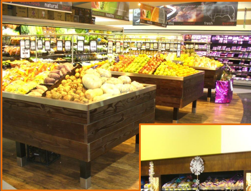
Fruit Bins New Farm