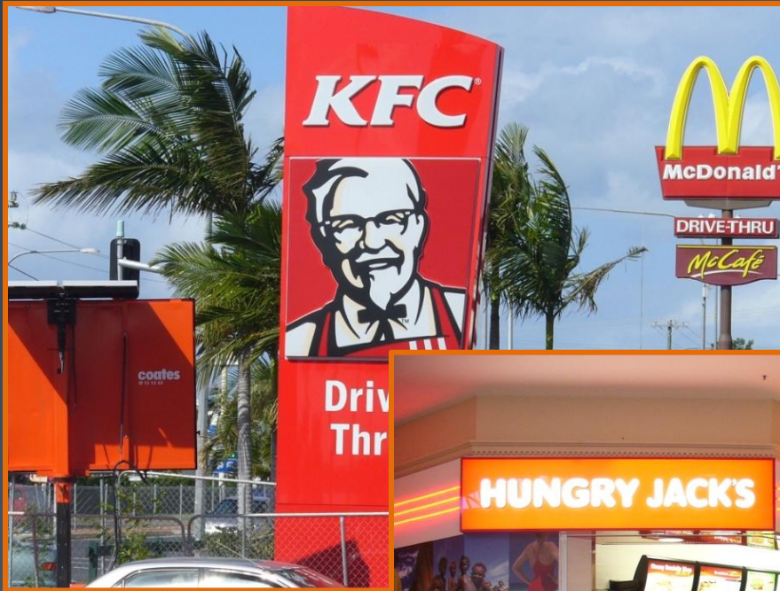
KFC Hervey Bay