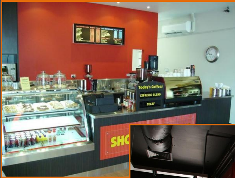
Shots Coffee Burpengary