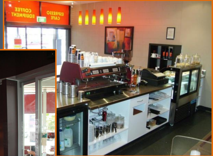
Shots Coffee Burpengary