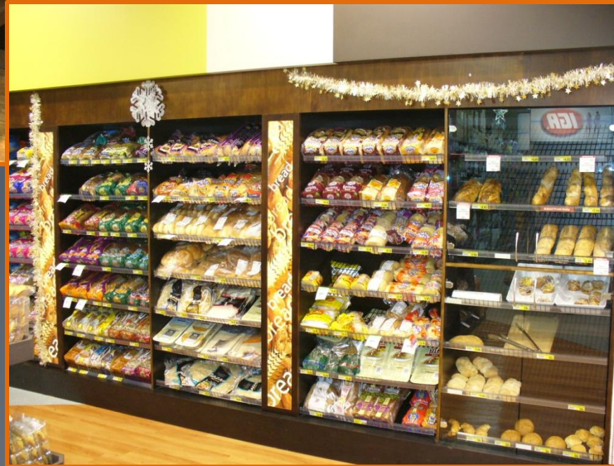
Bread Wall Cleveland