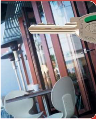
Stylish, convenient and flexible