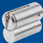
ABUS Pfaffenhain cylinder

We do not undertake any liability for modifications in technology, changes in colour and errors. ABUS © 03/2011