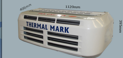
TM-500 II Condenser Unit Approx. weight 37kg