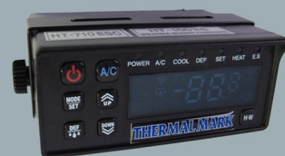
Digital In-cab control box with Auto Start function