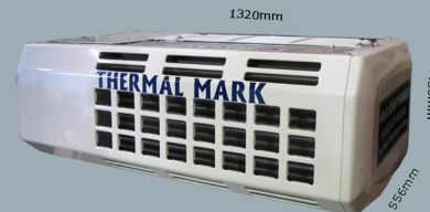
TM-500 ESC Condenser Unit Approx. weight 133kg Available in 415v or 240v