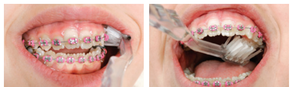
Brush the outside surfaces and the inside surfaces of the upper teeth.