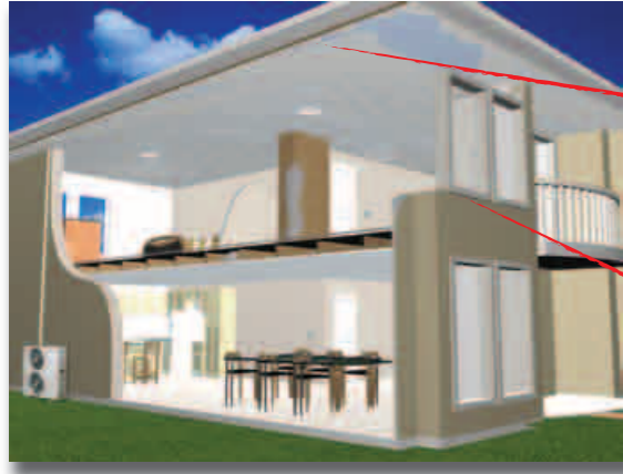
Discreet Air Vents