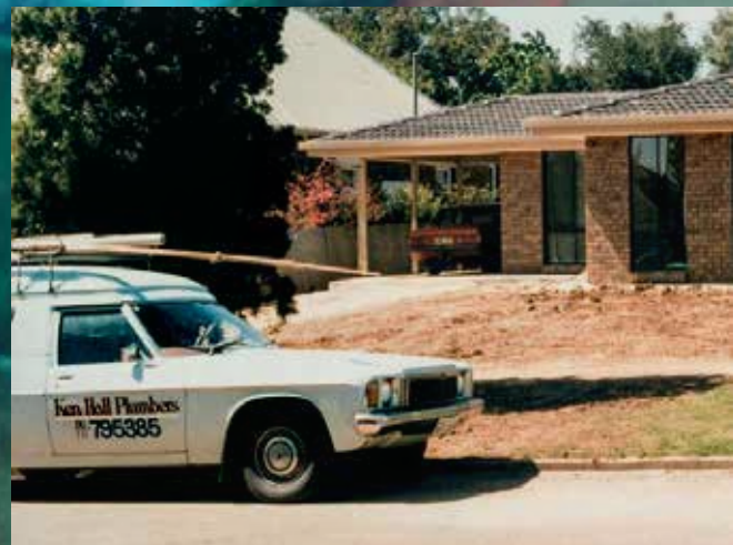
Ken Hall Plumbers vehicle, 1983