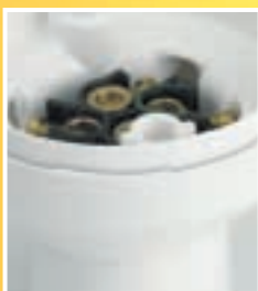
Built-in Safety Removable cover does not fall onto globe.