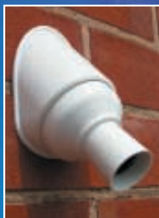
Step 5 Product is ready for light globe insertion.

NOTE: SILICON SEALANT Recommended around cable & mortar joint when mounting to ensure 'IP' Rating.