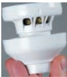
Cover Removal Cover can be completely removed after alignment.