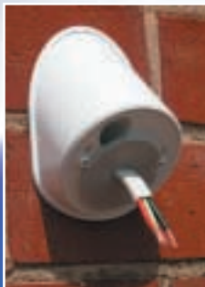
Step 2 Position adhesive gasket and pass cable through.