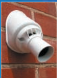
Step 4 Secure Battenholder to 530AWP.