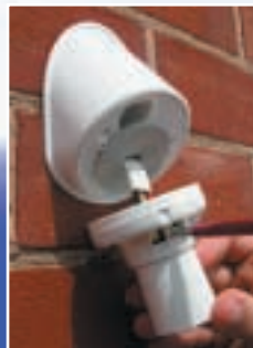
Step 3 Terminate Battenholder.