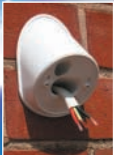
Step 1 Mount 530AWP on wall & pull through cable.

Now you can install Clipsal Battenholders outside without having to worry about the weather. With an IP23 protection rating, the new 530 AWP Weatherproof Adaptor is perfectly designed for installing lighting outside. It can be used with several Clipsal Battenholders, including the 530 Series and the new 2530 Series, and saves you the cost of installing expensive floodlights.