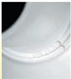
Visual Indicators Align indicators to remove cover.

Clipsal's new range of 2530 Battenholders pack more features than any other battenholders in the competition. The range consists of three different versions to suit any application, and they're all simple to install and boast the latest safety features. Simply rotate the cover 120° for easy removal, and a new built-in safety feature prevents the cover from accidentally falling onto a hot globe. Terminal slots are accessible, even after installation, and small protectors prevent accidental finger access. Finally, to ensure a clean appearance, there are no unsightly screwheads.