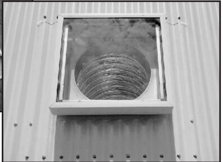
Vented Series 1

* sample photo only. BAL skylight will have glass top*