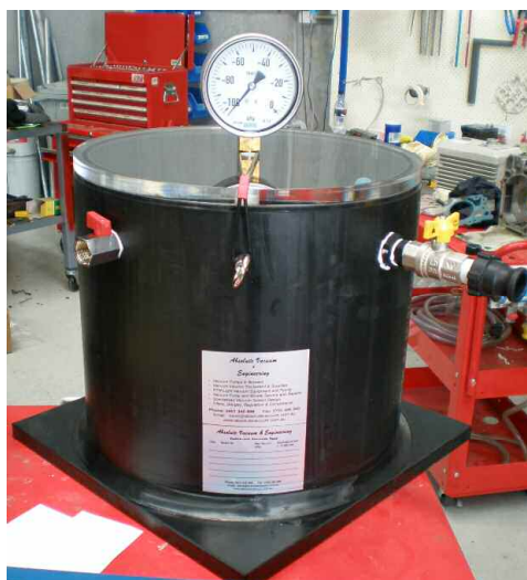
20 Litre Degassing Pot