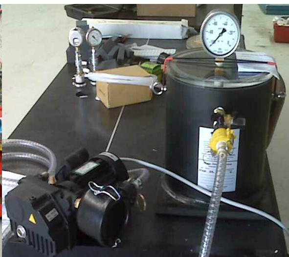
10 litre Degassing Pot with 8m3/hr Pump