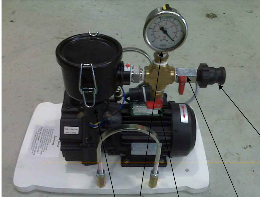
Typical Pump setup with a filter, Gauge, bleed valve and close off valve and cam lock quick-connect coupler for the hose.