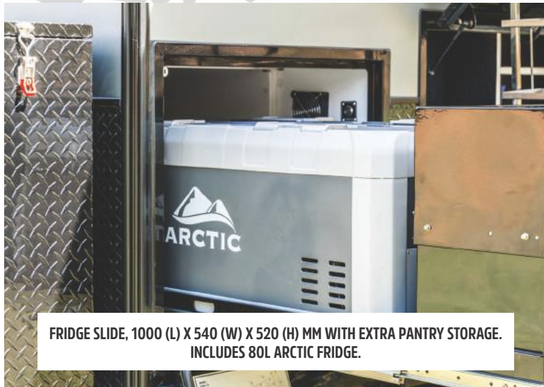
FRIDGE SLIDE, 1000 (L) X 540 (W) X 520 (H) MM WITH EXTRA PANTRY STORAGE. INCLUDES 80L ARCTIC FRIDGE.