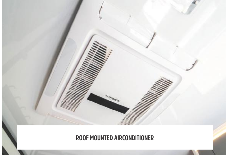
ROOF MOUNTED AIRCONDITIONER