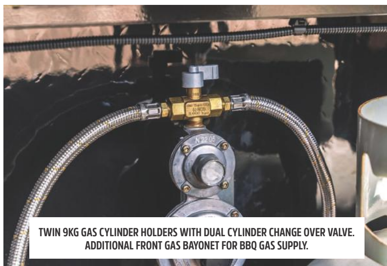
TWIN 9KG GAS CYLINDER HOLDERS WITH DUAL CYLINDER CHANGE OVER VALVE. ADDITIONAL FRONT GAS BAYONET FOR BBQ GAS SUPPLY.