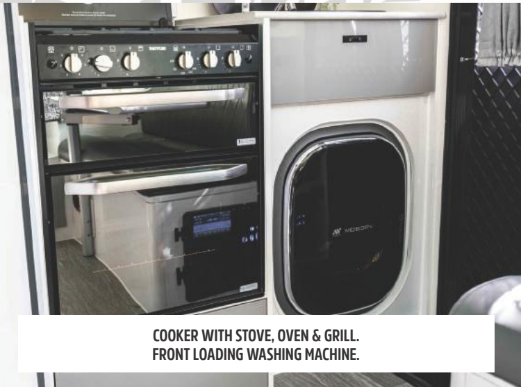
COOKER WITH STOVE, OVEN & GRILL. FRONT LOADING WASHING MACHINE.