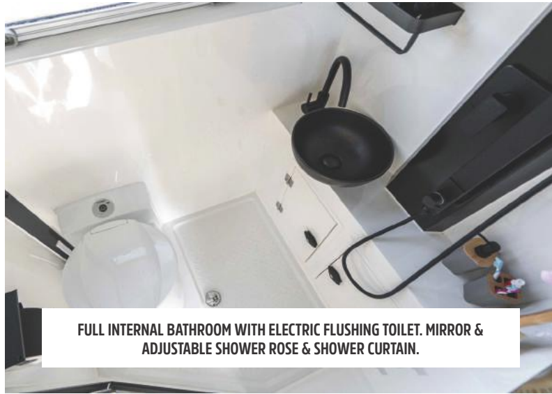
FULL INTERNAL BATHROOM WITH ELECTRIC FLUSHING TOILET. MIRROR & ADJUSTABLE SHOWER ROSE & SHOWER CURTAIN.