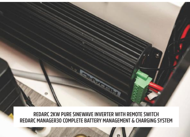
REDARC 2KW PURE SINEWAVE INVERTER WITH REMOTE SWITCH REDARC MANAGER30 COMPLETE BATTERY MANAGEMENT & CHARGING SYSTEM