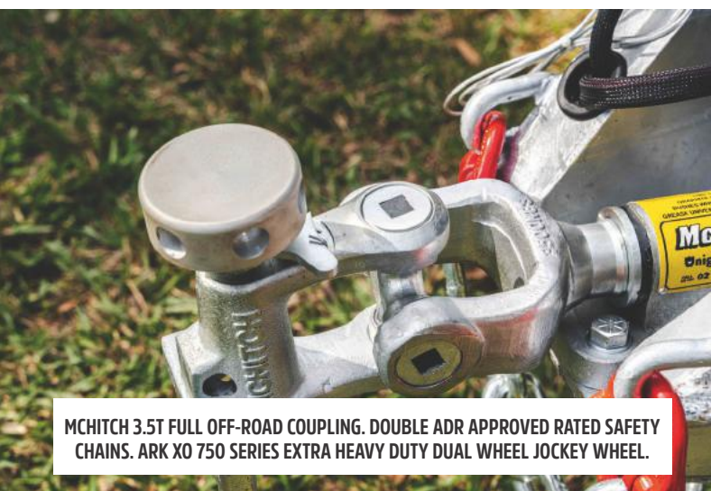
MCHITCH 3.5T FULL OFF-ROAD COUPLING. DOUBLE ADR APPROVED RATED SAFETY CHAINS. ARK XO 750 SERIES EXTRA HEAVY DUTY DUAL WHEEL JOCKEY WHEEL.