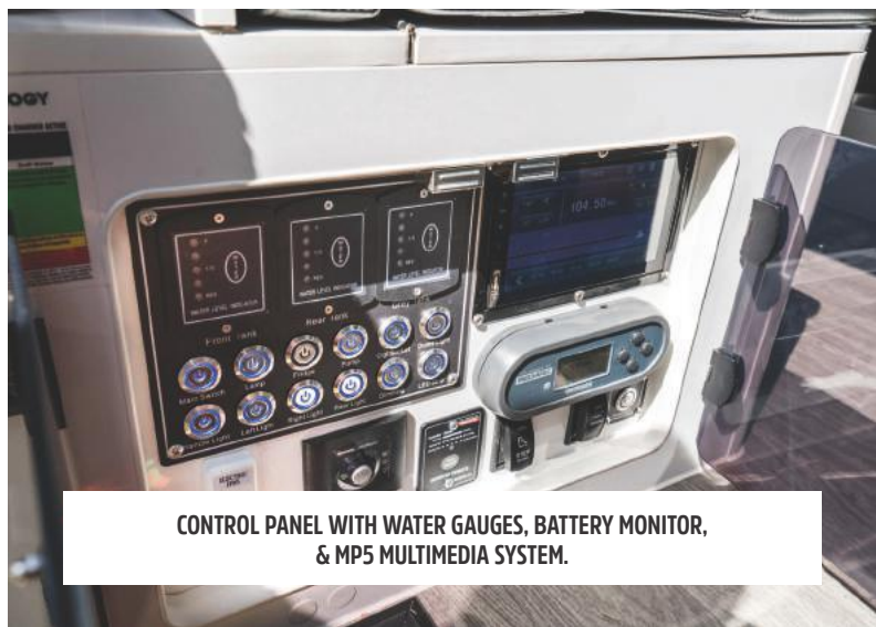
CONTROL PANEL WITH WATER GAUGES, BATTERY MONITOR, & MP5 MULTIMEDIA SYSTEM.