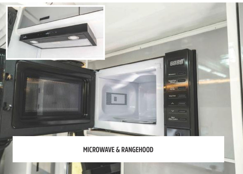
MICROWAVE & RANGEHOOD