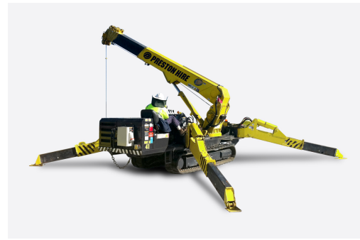
Model SUPERC Capacity 6000kg a Read m