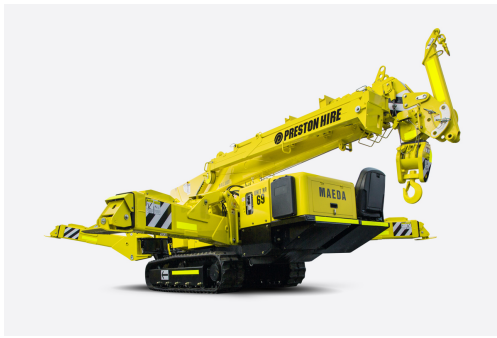
Model SUPERCRAPE MC-405C Capacity 3830kg at 2.7m Read more >