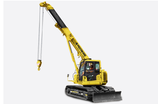
Model SUPERC Capacity 6000kg a Read m