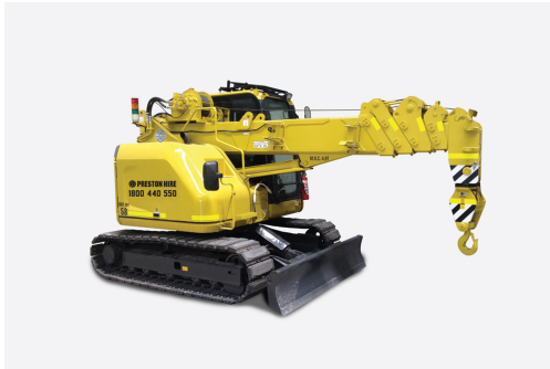
Model SUPERCRAPE LC-785 Capacity 4900kg at 2.0m Read more >