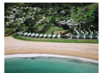
East's Beach Today

From a dairy farm back in the 19th century, Easts Beach has grown into a glorious tourist destination that sees loyal guests coming back again and again. The holiday park was built on strong foundations of hard work, determination and a passion for the industry. Several lifetimes worth of work have gone into creating a reputable establishment that strives to give guests the best possible experience. No doubt the holiday park will continue to excel and remain a treasured part of Kiama for many more years to come.