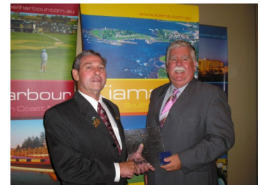
Tourism Industry Awards