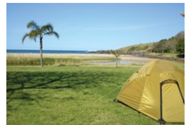
Overlooking the Lagoon