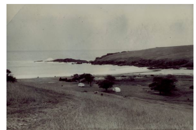
Easts' Beach in the 1930s

By the time Bruce took ownership of "Prospect" visitors began to come over the hill to gaze down at what is now known as Easts Beach. After a time, men carrying tents on their back were asking if they could set up camp and Bruce was happy to oblige. With Australian hospitality at its best, it wasn't long before others found their way to the secluded lagoon. The family dairy remained fully operational with campers and cows sharing the land in harmony.