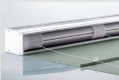
The mechanism is concealed in an unobtrusive cassette.