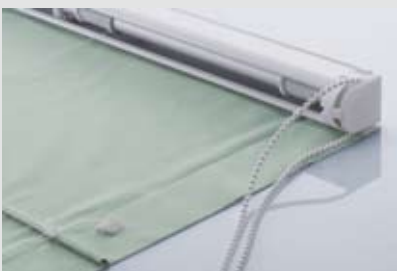
Easy cleaning. Cords stay in place after cleaning thanks to the cord release pin.