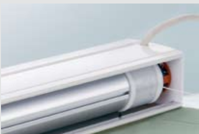
The system Silent Gliss 2350 represents the first Silent Gliss roman blind system with a tubular motor completely hidden inside the cassette.