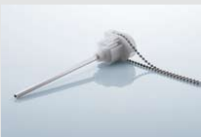
The system Silent Gliss 2330 is produced with an optimised gear drive and can be used for fabrics up to 4.5 kg (4:1 ratio).