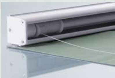
New wind-up mechanism.