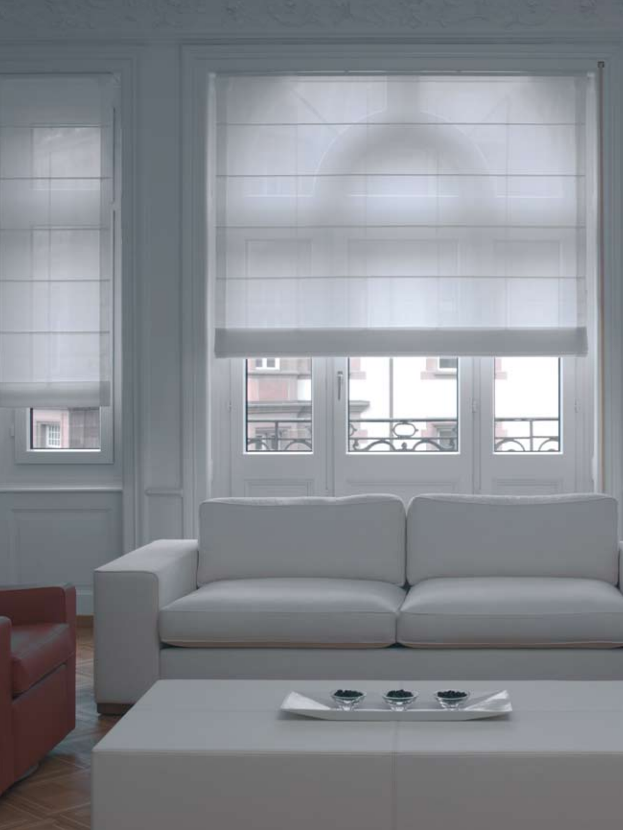
Silent Gliss Roman Blind System