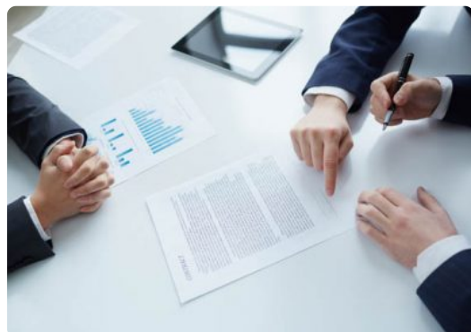
10 Ways To Keep Legal Fees Down