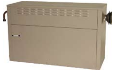
Brivis MX - Outdoor Unit