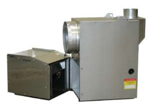
The Internal Brivis Two Piece Wombat for easier installation.

The Brivis Buffalo Series heaters are perfectly designed to be installed unobstrusively outside your home.