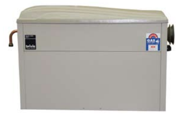
Brivis HX - Outdoor Unit

The technologies used in the Brivis StarPro series are a culmination of Brivis' 50 years of heating experience in Australia. The Brivis StarPro series features ensure that the heaters are more effective at heating your home, with the least amount of energy and expense. Every aspect of the Brivis StarPro series has been designed to make it more powerful, efficient, reliable, unobtrusive and healthy for you.