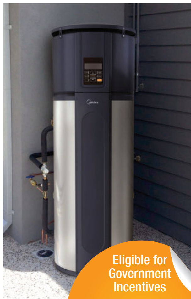
280L Installed Unit