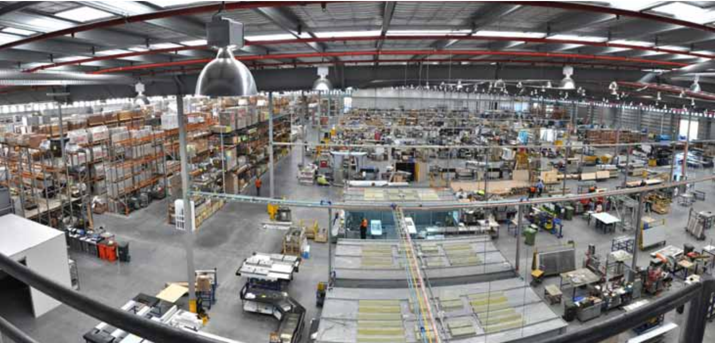
The new Stoddart manufacturing facility in Queensland.