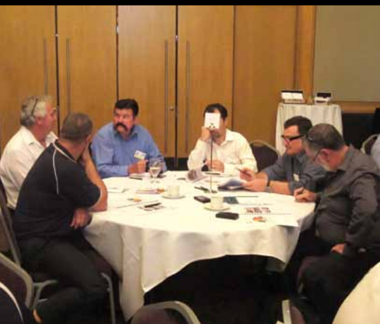
Plumbing workshop – Understanding the National Construction Code