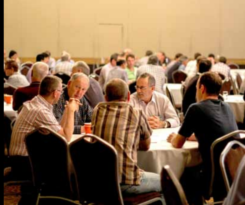
Teams working together in the workshops