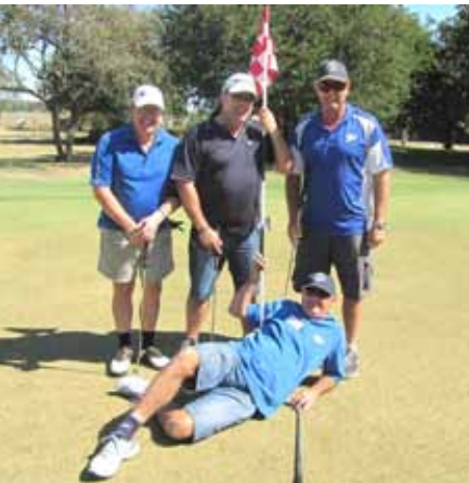
Players enjoying the fun spirited day.