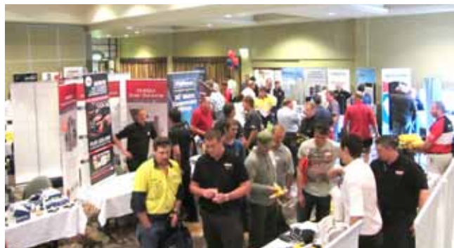
Great turn out at the Toowoomba Plumbing Forum & Expo in March

Plans for the 2014 Expos are now underway and we look forward to visiting the regions again next year. Dates for 2014 will be made available soon. If you have any comments or feedback regarding these events, please contact MPAQ on 3273 0800 or events@mpaq.com.au .