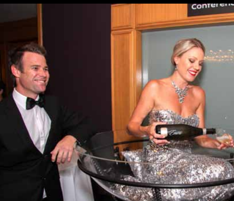
Gala Dinner guests greeted with a glass of champagne on arrival