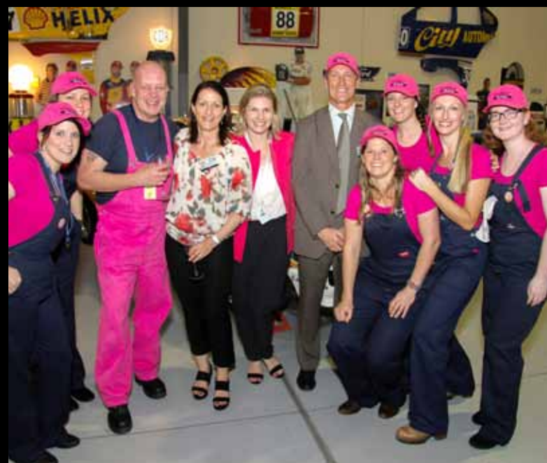
The conference organising team with sponsors of the Think Brick Garage 88 Dinner