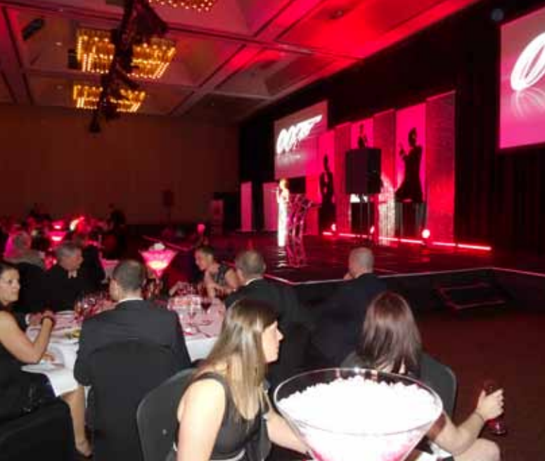
James Bond '007' theme Gala Dinner Event