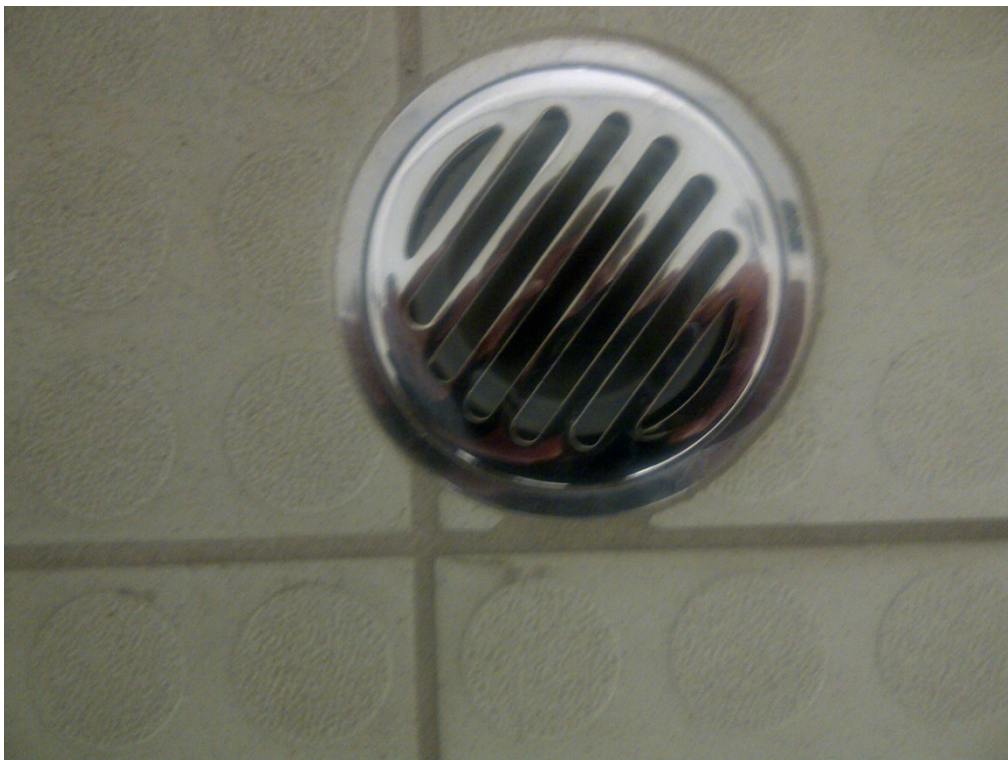
The floor waste complete with Drain Guardian installed

The entire process of installation was completed to ensure the sceptical, long suffering Aidan Clarke that the Drain Guardian would provide greater protection to any form of odour emission from the floor waste and end the problem he had been enduring.