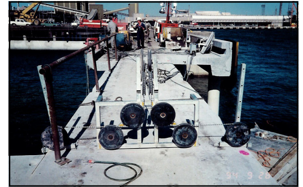
Wire sawing wharf at Koorigang island

For mass reinforced concrete, brick or stone cutting any size.