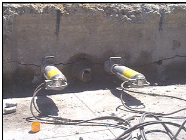
Splitting large hob wall

Splitting is great for mass concrete and rock. Quiet and vibration free.