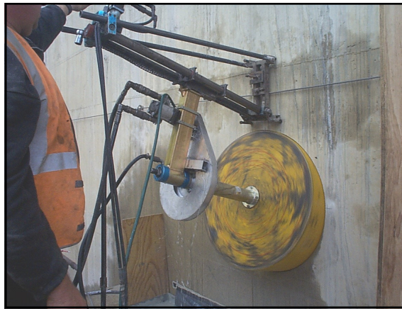
Core holes at Warragamba dam 950mm diameter x 1100mm deep