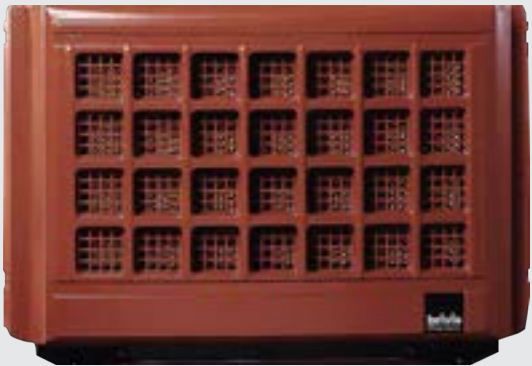
Brivis AD Cooler