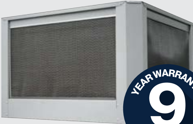
Brivis AD BAL