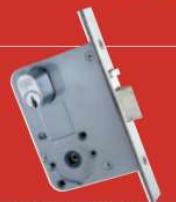
3570 Series Mortice Locks