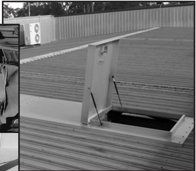
All Metal Hatch (AMH)

The safe way to access your roof, and bring natural light into your home or business!