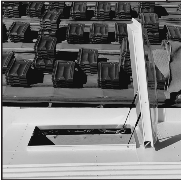
Sky Hatch (SH)