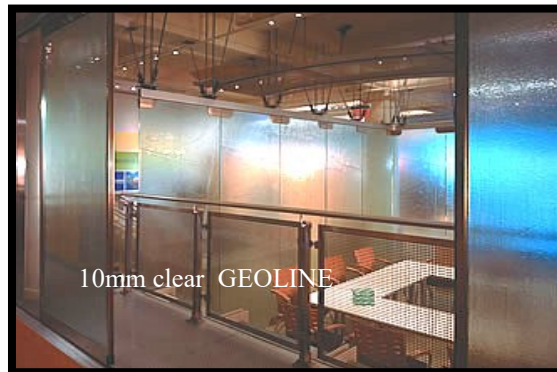
10mm clear GEOLINE