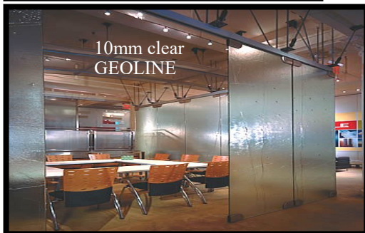
10mm clear GEOLINE