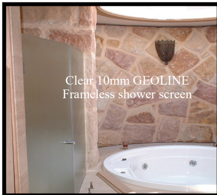
Clear 10mm GEOLINE Frameless shower screen