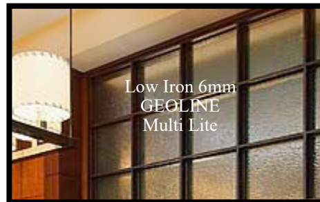
Low Iron 6mm GEOLINE Multi Lite