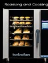
Roasting and Cooking