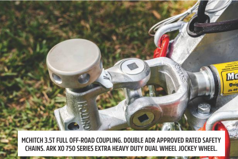
MCHITCH 3.5T FULL OFF-ROAD COUPLING. DOUBLE ADR APPROVED RATED SAFETY CHAINS. ARK X0 750 SERIES EXTRA HEAVY DUTY DUAL WHEEL JOCKEY WHEEL.