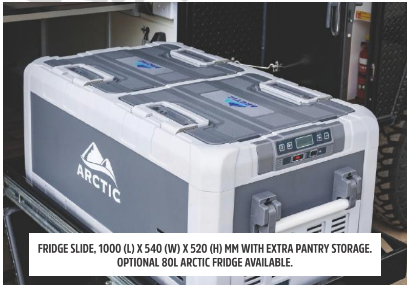
FRIDGE SLIDE, 1000 (L) X 540 (W) X 520 (H) MM WITH EXTRA PANTRY STORAGE. OPTIONAL 80L ARCTIC FRIDGE AVAILABLE.