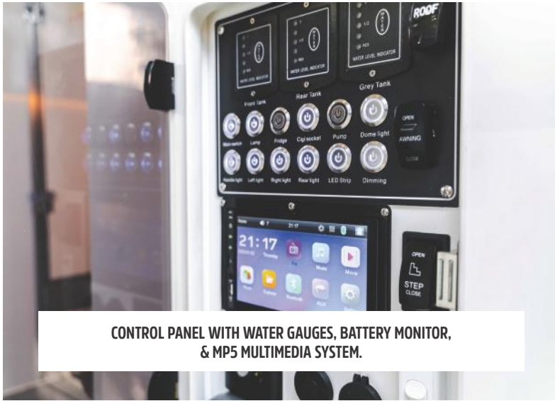
CONTROL PANEL WITH WATER GAUGES, BATTERY MONITOR, & MP5 MULTIMEDIA SYSTEM.