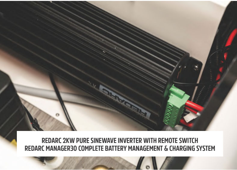
REDARC 2KW PURE SINEWAVE INVERTER WITH REMOTE SWITCH REDARC MANAGER30 COMPLETE BATTERY MANAGEMENT & CHARGING SYSTEM