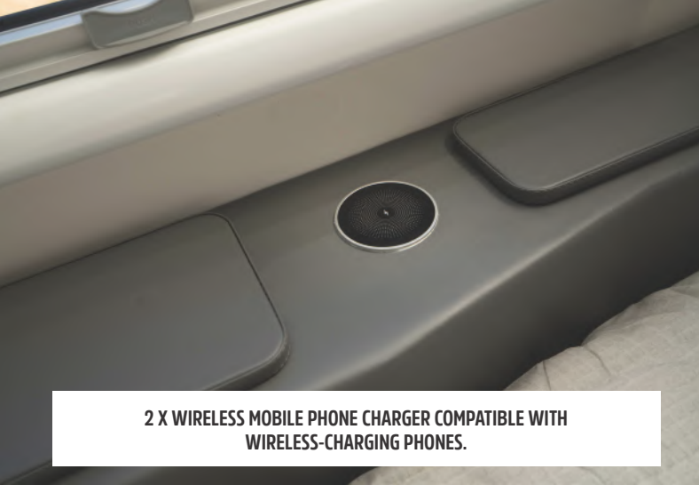
2 X WIRELESS MOBILE PHONE CHARGER COMPATIBLE WITH WIRELESS-CHARGING PHONES.