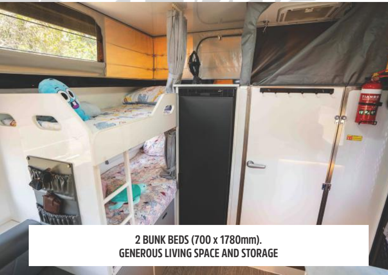
2 BUNK BEDS (700 x 1780mm). GENEROUS LIVING SPACE AND STORAGE