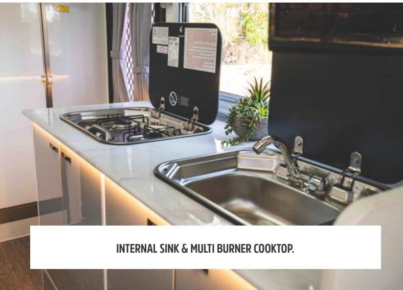
INTERNAL SINK & MULTI BURNER COOKTOP.