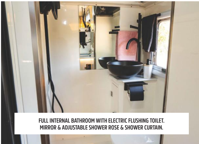
FULL INTERNAL BATHROOM WITH ELECTRIC FLUSHING TOILET. MIRROR & ADJUSTABLE SHOWER ROSE & SHOWER CURTAIN.