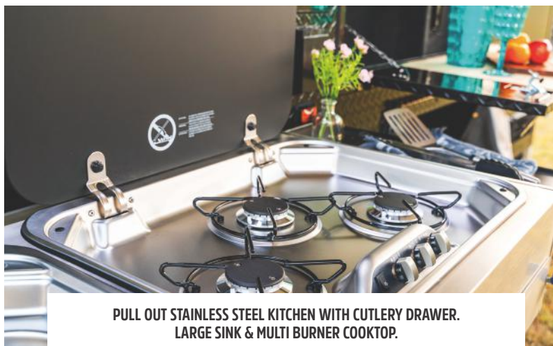
PULL OUT STAINLESS STEEL KITCHEN WITH CUTLERY DRAWER. LARGE SINK & MULTI BURNER COOKTOP.