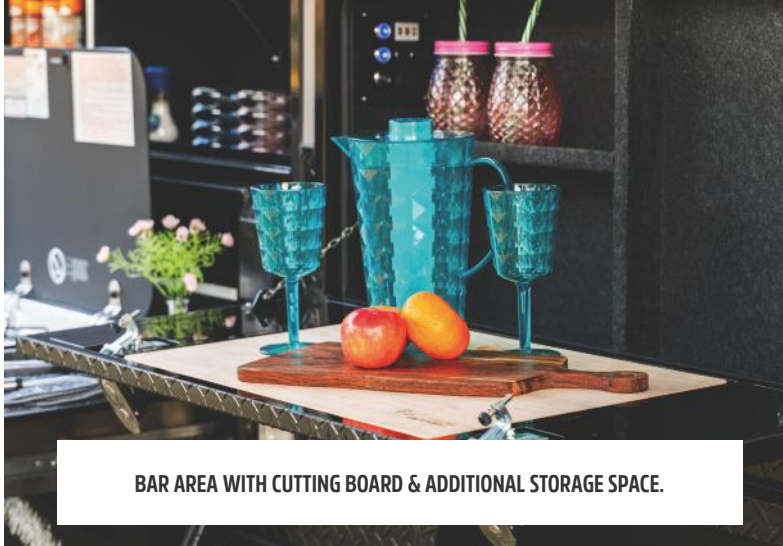
BAR AREA WITH CUTTING BOARD & ADDITIONAL STORAGE SPACE.