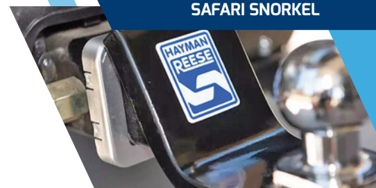
TOW BAR KIT

Want to know more? Call our team to discuss the full range of products on offer!