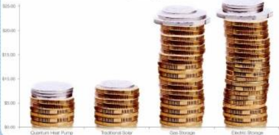
Weekly Running Cost