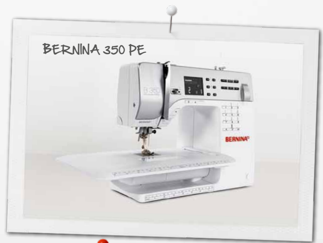
BERNINA 350 PE