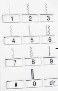
Direct-selection buttons for quick access to hundreds of stitches