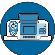
MMI interactive digital interface