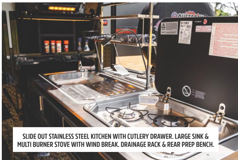
SLIDE OUT STAINLESS STEEL KITCHEN WITH CUTLERY DRAWER. LARGE SINK & MULTI BURNER STOVE WITH WIND BREAK. DRAINAGE RACK & REAR PREP BENCH.