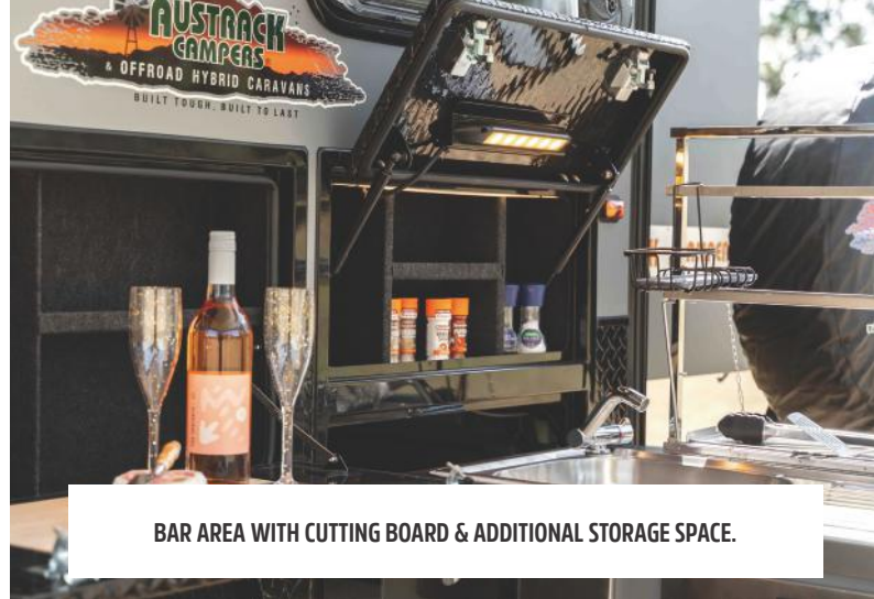
BAR AREA WITH CUTTING BOARD & ADDITIONAL STORAGE SPACE.