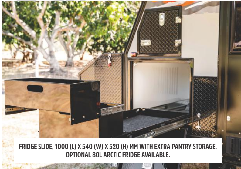
FRIDGE SLIDE, 1000 (L) X 540 (W) X 520 (H) MM WITH EXTRA PANTRY STORAGE. OPTIONAL 80L ARCTIC FRIDGE AVAILABLE.