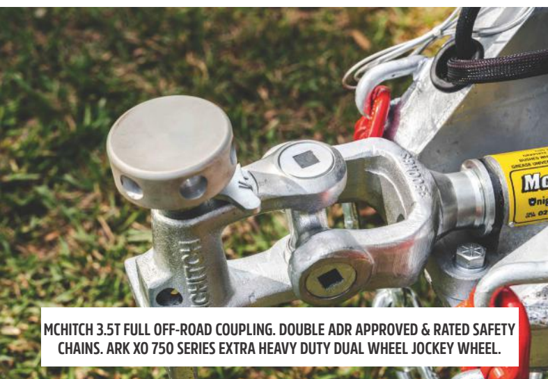
MCHITCH 3.5T FULL OFF-ROAD COUPLING. DOUBLE ADR APPROVED & RATED SAFETY CHAINS. ARK XO 750 SERIES EXTRA HEAVY DUTY DUAL WHEEL JOCKEY WHEEL.