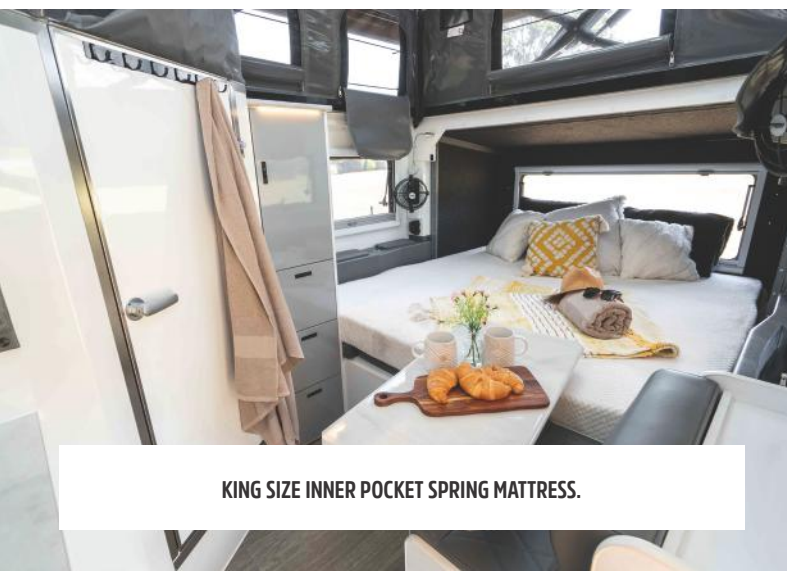
KING SIZE INNER POCKET SPRING MATTRESS.