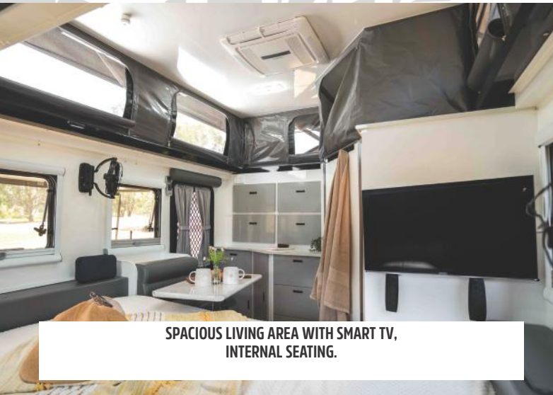
SPACIOUS LIVING AREA WITH SMART TV, INTERNAL SEATING.