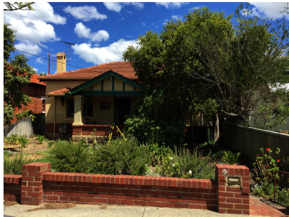
Front view of 61 Matlock St - looking west

Note: SITE SURVEY only. The information shown on this drawing is current as at the Date of Survey. Boundary information, Easements etc. to be verified from the Certificate of Title, Plan/Diagram or a Boundary Repeg. Boundary position approximate only. Location of boundary pegs or fences in relation to the boundary lines are not guaranteed. Sewer/Drainage may vary from schematic presentation, clearances to be checked on site. Services information to be confirmed with relevant AUTHORITIES. For underground services - ring "DIAL BEFORE YOU DIG" for confirmation of those services.