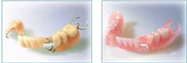
The Valplast® partial is more comfortable and light-weight than conventional metal partials.