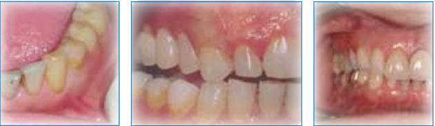
Valplast® is made from a translucent nylon material that blends in with your natural gum tissues to become virtually invisible when placed in the mouth.